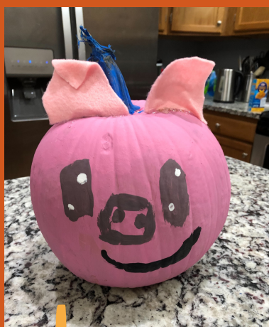
Second place pumpkin by Violet B.